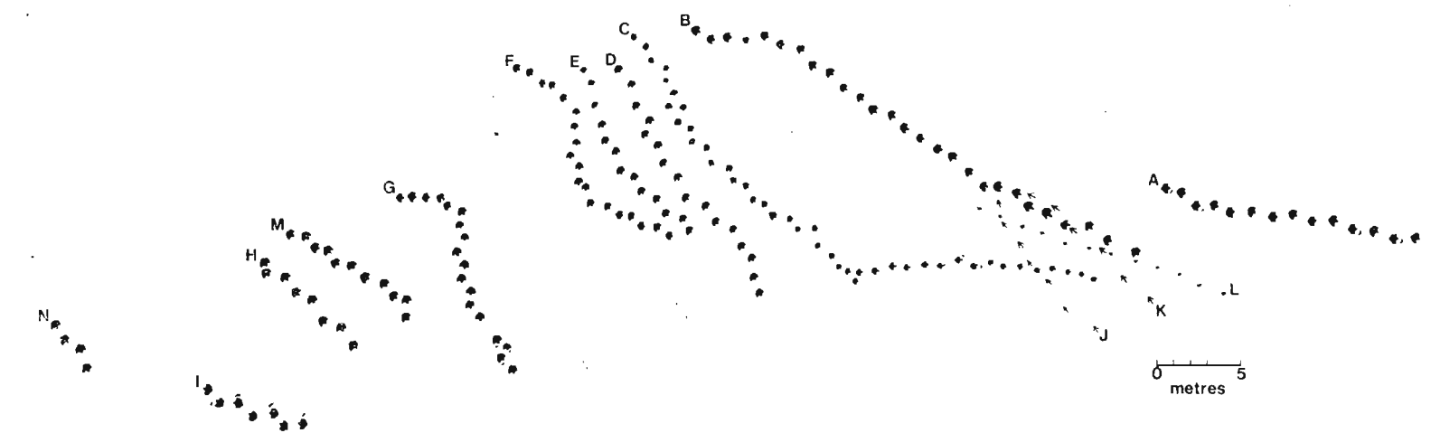
Fig. 2. Map of a portion of Provincial Museum of Alberta Site 8 in the Peace River Canyon, showing trackways of Amblydactylus gethingi (A, B, C, D, E, F, G, H, I, M, N) and Irenesauripus acutus (J, K, L). All footprints were mapped in the field. Because of the reduced scale and the complexity of the drawing, a standard outline has been used for the Amblydactylus footprints (except for trackway C). The only place where this practice may have had a significant effect is Trackway M, where none of the footprints are well enough preserved to indicate with certainty the direction the animal was going.