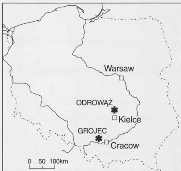
Fig. 1. Localities of Early Jurassic insect fossils in Poland.

1991b). The floristic assemblage includes mainly thermophilous taxa indicating a warm climate (Weisło-Luranc 1991a). The results of the palynological investigations (Ziaja 1991) correspond well with the data based on the macroflora. The palynomorph complex includes isoetalean spores determined as Artrispurites minimus , an index species for the earliest Jurassic.