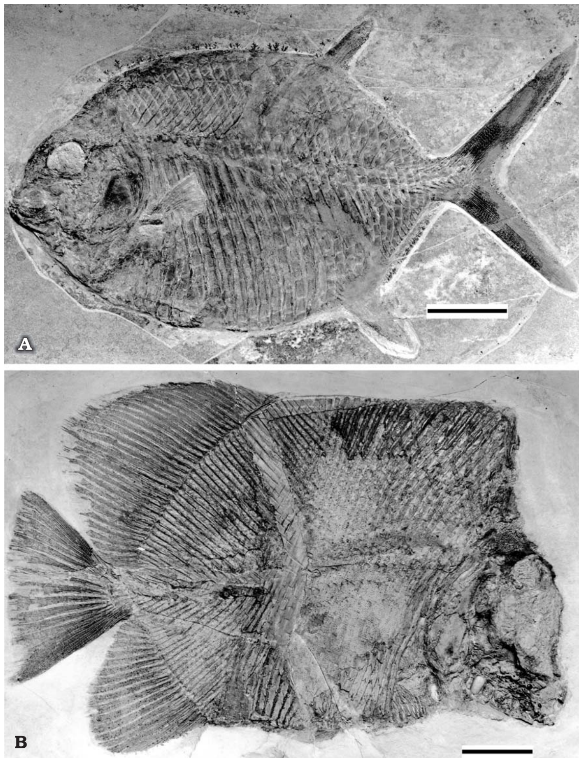
Fig. 3. Late Jurassic pycnodonts to exemplify the body form and arrangement of unpaired fins. A. Gyrodus hexagonus (de Blainville, 1818) (JME SOS 3163) from the Tithonian of Eichstätt, southern Germany. B. Apomesodon gibbosus (Wagner, 1851) (JME SOS 3572a) from the Tithonian of Eichstätt, southern Germany. Scale bars 5 cm.

thunniform swimmers like recent mackerel sharks or tunas (AR 4.5 to 7.2; Sambilay 1990; Sfakiotakis et al. 1999). Thus, although its body was high and laterally flattened like in other pycnodonts and modern fishes with carangiform swimming mode (AR 1 to 2), the swimming mode of Gyrodus was probably more efficient than in those fishes. As mainly the caudal