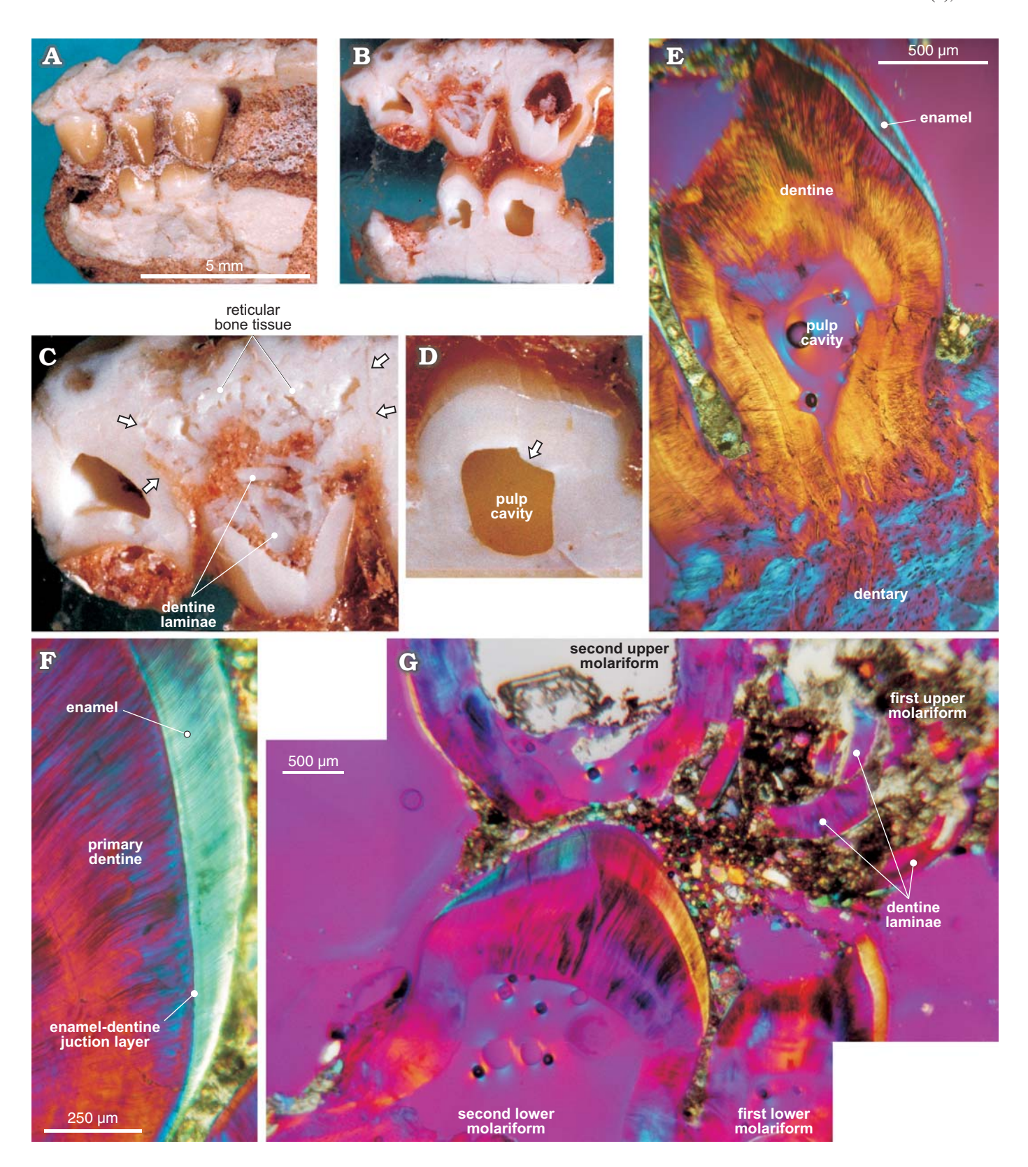
Fig. 1. The procolophonid Soturnia caliodon Cisneros and Schultz, 2003, UFRGS PV1112T, from the Norian (Upper Triassic) Caturrita Formation of Rio Grande do Sul, Brazil. Partial left maxilla and mandible, before preparation ( A ), and during initial stages of preparation ( B ). C . I2 (to the left) and M1 (to the right), showing the limits of tooth morphogenetic fields (indicated by arrows), reticular bone tissue, fragmentary dentine, indicating tooth resorption in M1. D . A pronounced secondary dentine pulp deposition (indicated by an arrow) in m2. E . m1, note that enamel is completely absent in the cervix. F . Portion of m2 crown, showing the transition of thick enamel in the apex (to the top) to a very thin enamel close to the cervix (to the bottom). G . M1, M2, m1 and m2. Note remnant dentine fragments in most of M1. A–D in labial view, anterior is to the left. E–G in lingual view and under polarized light.