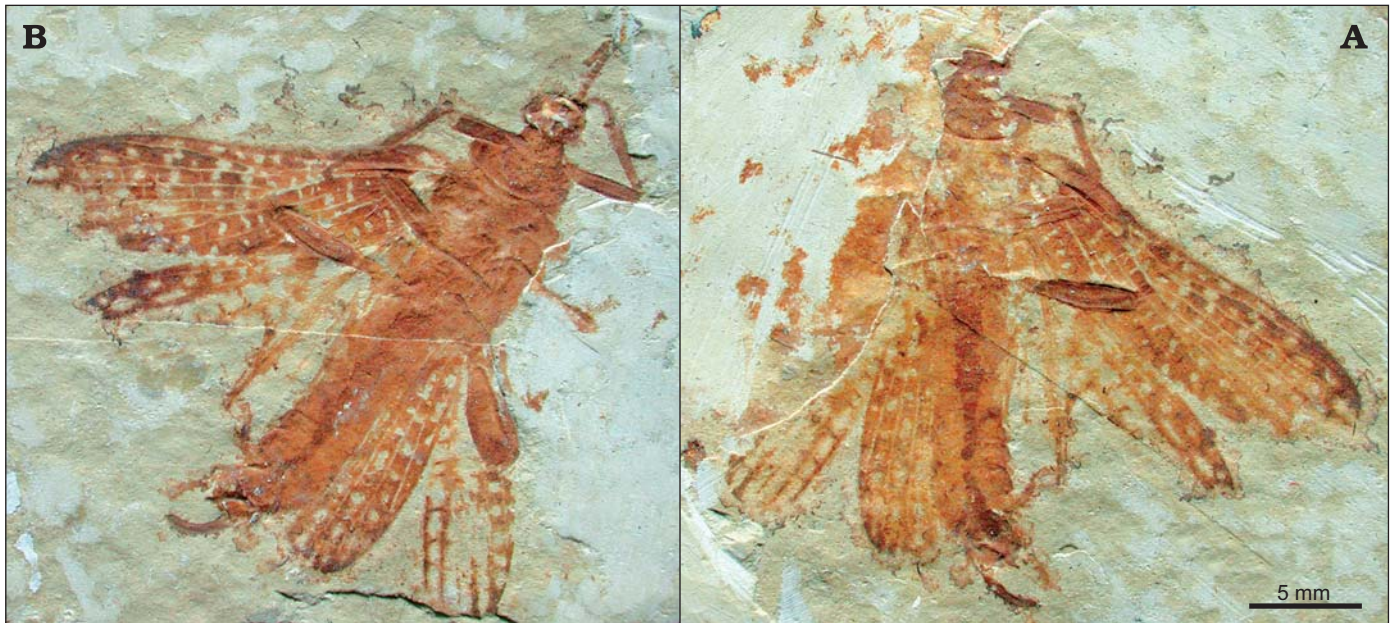
Fig. 1. Susumaniid stick insect Renphasma sinica gen. et sp. nov., holotype A31857, Beipiao City, China, Lower Cretaceous, Yixian Formation. Photographs of print (A) and counterprint (B).

straight, reaching posterior wing margin, a weak but poorly preserved anterior branch of CuP reaching MP+CuA very near to its base; two simple and straight anal veins, anal area 1.3 mm wide.