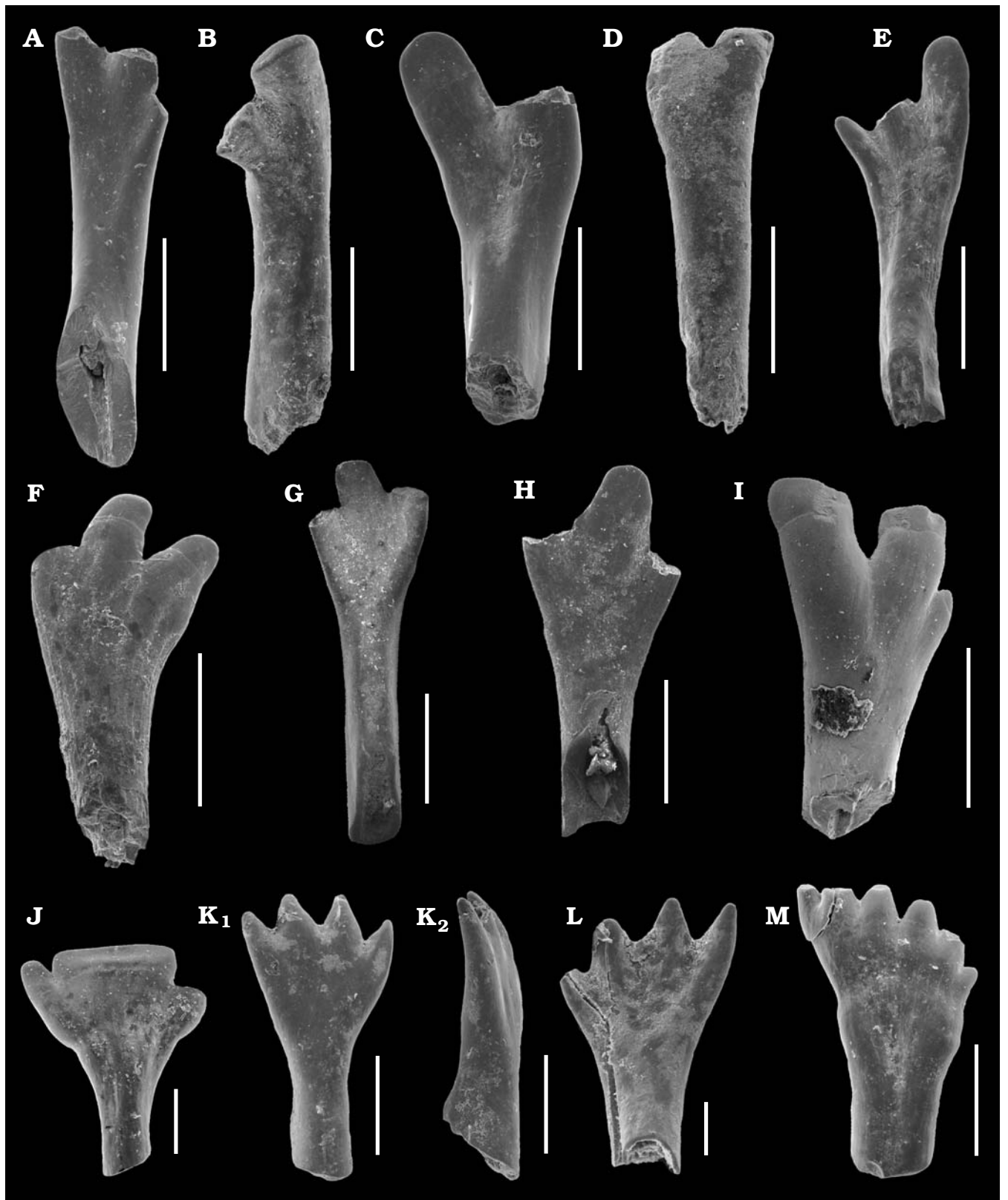
Fig. 2. The isolated teeth of actinopterygian fish Isadia from the Sokovka outcrop, Vyazniki, Russia, late Permian (Upper Vyatkian). A–D. Isadia aristoviensis Minikh, 1990, mandibular teeth. A. ZPAL V.51/1, lingual view. B. ZPAL V.51/2, labial view. C. ZPAL V.51/3, lingual view. D. ZPAL V.51/4, labial view. E–I. Isadia aristoviensis Minikh, 1990, maxillary teeth. E. ZPAL V.51/6, lingual view. F. ZPAL V.51/7, labial view. G. ZPAL V.51/5, lingual view. H. ZPAL V.51/8, lingual view. I. ZPAL V.51/9, labial view. J. Isadia arefievi Minikh, 2015, ZPAL V.51/10, mandibular tooth, ?lingual view. K, L. Isadia suchonensis Minikh, 1986, mandibular teeth. K. ZPAL V.51/11, lingual ( K_1 ) and lateral ( K_2 ) views. L. ZPAL V.51/12, labial view. M. Isadia suchonensis Minikh, 1986, ZPAL V.51/13, maxillary teeth, ?labial view. Scale bars 1 mm (A–I), 0.5 mm (J, K, M), 0.2 mm (L).